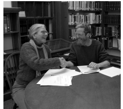
A congratulatory handshake